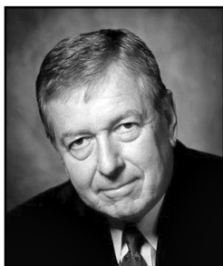
Speaker: Honorable John D. Ashcroft Former U. S. Attorney General

Calling him a “man of great integrity, a man of great judgment and a man who knows the law,” President George W. Bush announced his decision to nominate John Ashcroft to serve as U.S. Attorney General on December 22, 2000. When Mr. Ashcroft left office four years later, violent crime was at a record low, gun crime was at an all-time low, a successful corporate crime crackdown had been launched, and more terrorist attacks on the U.S. had been prevented.