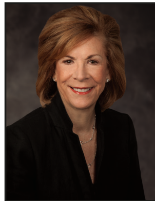
Hon. Winship C. Tower (Ret.) Retired Judge, Virginia Beach Juvenile and Domestic Relations Court