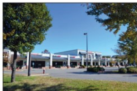
Foreclosure: Newport News Shopping Center