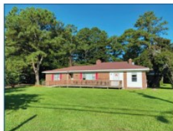
Chesapeake Commercial/Service Property