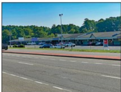
Gloucester Shopping Center