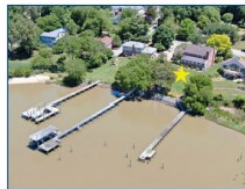
Trustee Sale: Newport News Home