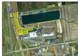
NC US Hwy. 17 Commercial Dev. Land: 20 Acres