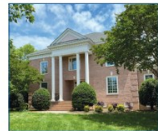
Estate: Williamsburg Home in Governor's Land