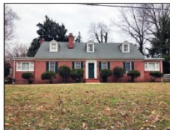
Estate: Williamsburg Home