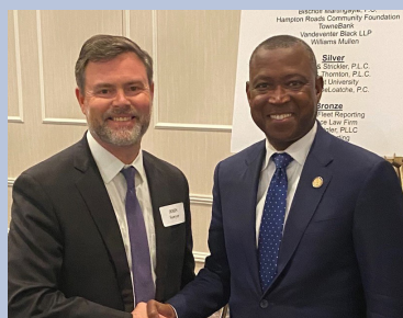
24th Annual Bench Bar Conference