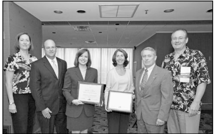
The NPBA Foundation received a Virginia State Bar Award of Merit. NPBA was also recognized for the first statewide Legal Food Frenzy.

We are continuing our scholarship program, working on several improvements to this successful and popular project. We also have several new projects we are considering for the coming year – details to come. Our main focus needs to be and continues to be raising funds so that we may invest and give to organizations that meet and serve the mission of the Foundation. In addition to our Fellows Program, we will be having additional fundraising opportunities so that all members of our Bar Association can find an appropriate outlet for giving. We thank you all for your continued support of the success of the Foundation.